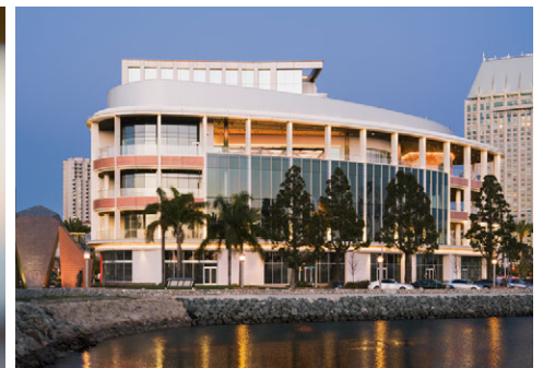
Edge building at RaDD