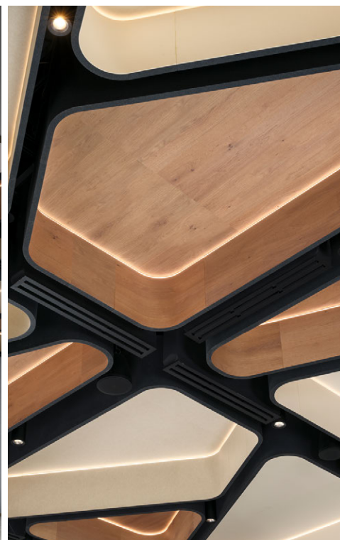
Custom Skipping Stones Ceiling Clouds