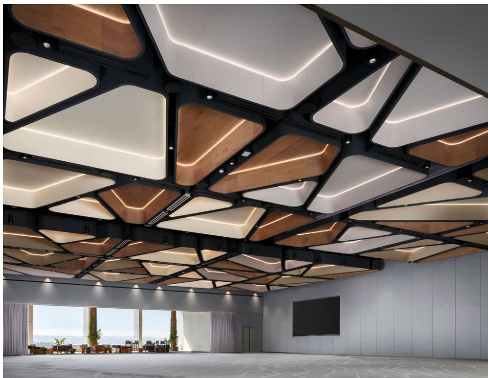
Eve ballroom, product shown: Custom Skipping Stones Ceiling Clouds and custom Fracture Wall Panels

The design concept, led by Gensler , emphasized warmth, acoustical comfort, and high-end aesthetics. This vision required a partner who could translate bold ideas into tangible, high-performance solutions.